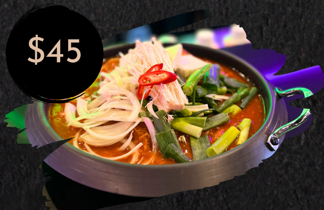
Spicy Kimchi Pork Stew