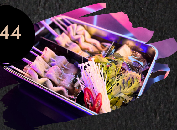
Assorted Fish Cake Soup