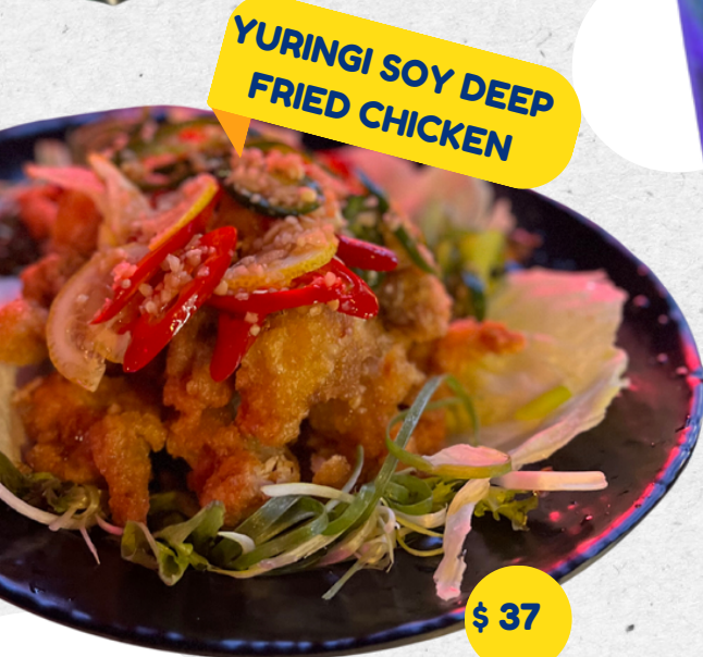
YURINGI SOY DEEP FRIED CHICKEN