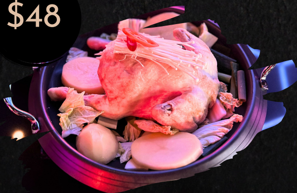
Whole Chicken Soup