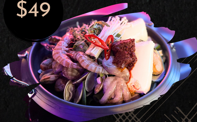
Seafood Silken Tofu Hotpot