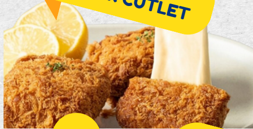
CHEESE MINCE PORK CUTLET