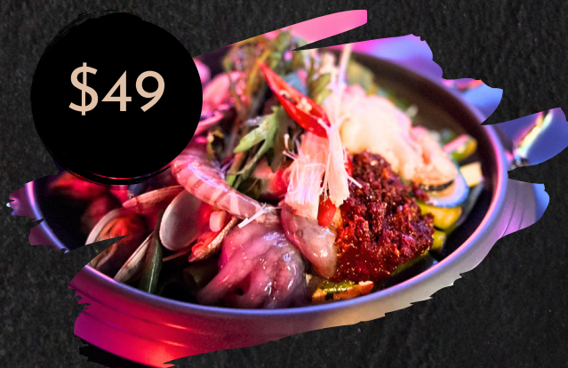
Spicy Seafood Hotpot