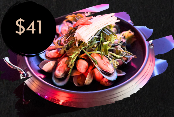
Mussel & Clam Soup